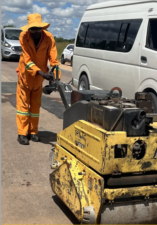
Departmental Inhouse Team working at Percyfyfe Road to Mashashane to patch potholes