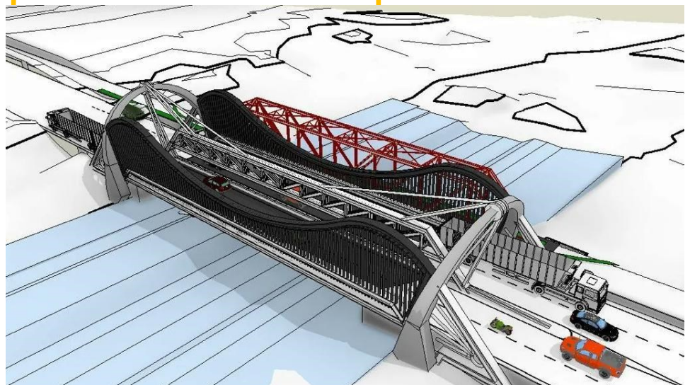
3D plan of the GaMalekana bridge that is to be constructed.